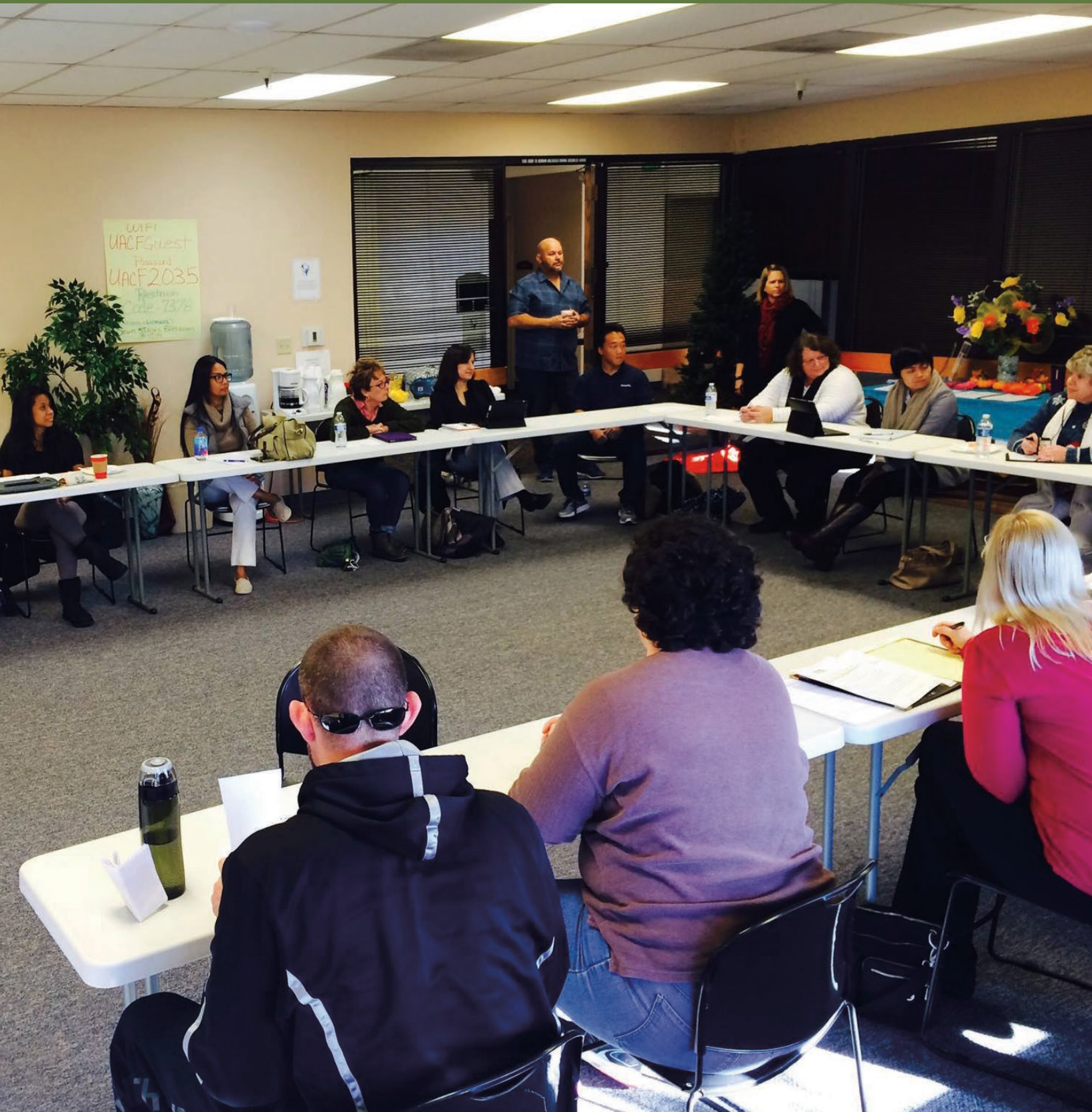
AbilityTools Regional Meeting discussing outreach strategies.